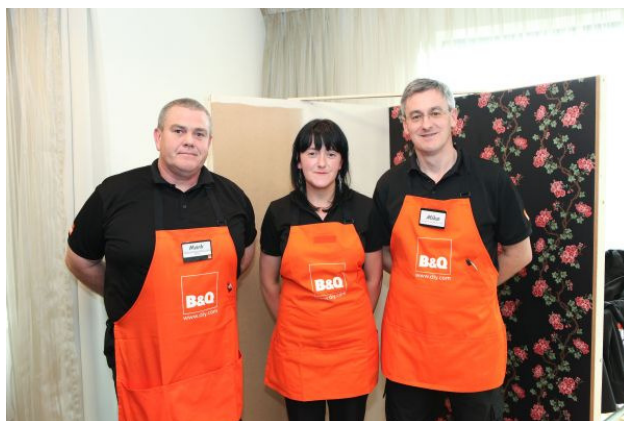
Right and far right: Delegates were treated to housing maintenance demonstrations by sponsors B&Q